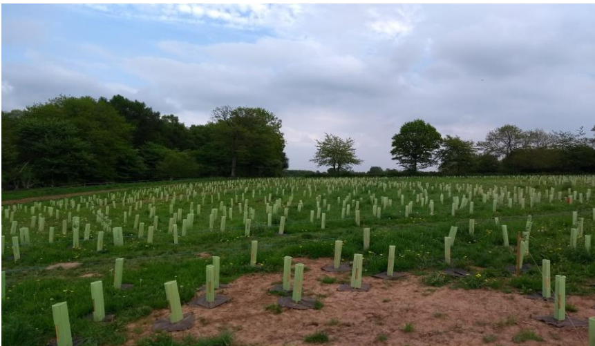
Tree planting in Burton Green

As part of preparing sites for the construction of HS2 we are undertaking a major conservation project to create a 'green corridor' alongside the route of HS2. This will include a network of habitats ranging from woodlands and meadows to wetlands and ponds. They will replace any habitats affected by the construction of HS2, while conserving and enhancing existing sites. We're committed to 'no net loss' in habitats for wildlife over the course of our works.